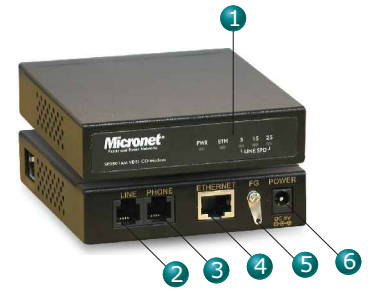
SP3501A Series VDSL CO/CPE Modem